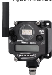
Figure 1. Internal battery model