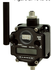
Figure 2. 10 to 30 V DC model