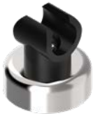
LMBM12MAG Attaches to M12 cordset end