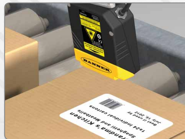
Sorting in an automated warehouse