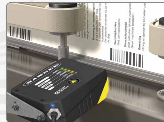
Quality and content control in the printing industry