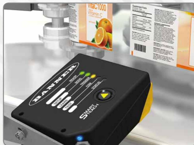
Lot control and traceability for a pharmaceutical manufacturer